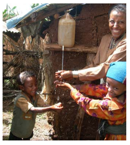
Family members using a household hand washing station.

In Year Four, activities in Ethiopia have been moving forward on many fronts, and efforts are starting to pay off with concrete results. The Amhara region of 20 million is "igniting" for total sanitation and hygiene, training, and mobilizing community by community with local districts leading the way. HIP, together with partners in the Water and Sanitation Program (WSP)/World Bank-AF, put a special focus on building capacity and supporting implementation in high intensity districts or woredas (four in total) and moderate intensity districts (another seven), with an emphasis on community- and household-level change through house-tohouse and community approaches, including non-branded total sanitation. Much time and effort was spent developing the