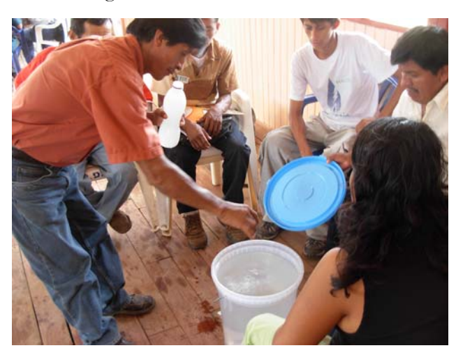
Conducting the training of trainers in Curmina, Peru.

MSH built into their annual plan the replication of the project activities in an additional 30 districts in seven regions of Peru. MSH staff continued to train local government officials and community