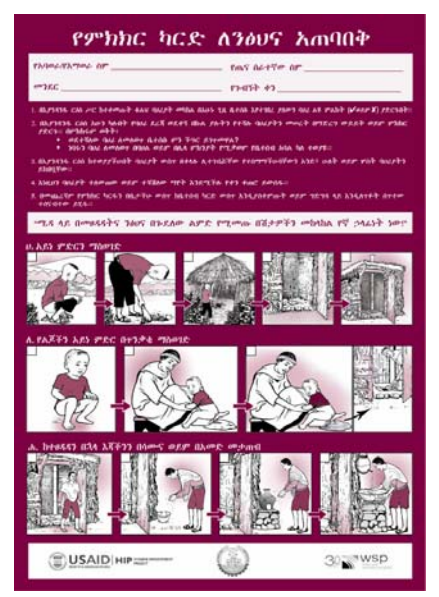
The MIKIKIR card in Amharic

Earlier in the year, informal monitoring of total sanitation support in Amhara districts showed that following the ignition program in four woredas, health extension workers and the kebele administrators focused more on latrine construction than on actual behavior change in the households carried out through negotiating improved practices. Monitoring also showed that ignition was not "spreading enough to reach scale. To address these issues, the Regional Health Bureau