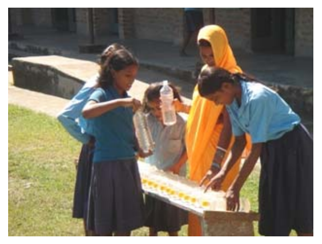
School club members put SODIS bottles out for treatment. The stand holds 25 bottles and is tilted on one side for proper sun exposure.

The company's plan is to sell one million tablets of Aquatabs in six months through 3,500 nontraditional outlets such as HIV/AIDS awareness programs for transportation workers.