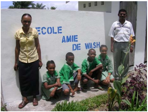
A WASH-friendly school

WASH" by the end of 2008. In response to an increased need for a pool of skilled trainers as HIP and the Ministry of Health take on this challenge, HIP/Madagascar organized a major capacity building initiative—a training of trainers with the top trainers of the country. A CSB guide was also developed. The big challenge facing HIP is how to help the CSBs address the hardware needs that are necessary for becoming WASH-friendly. HIP is identifying technical assistance and partnerships in this area. The WASH-friendly movement is now branching out to include markets, transportation hubs, tourist attractions, and journalists.